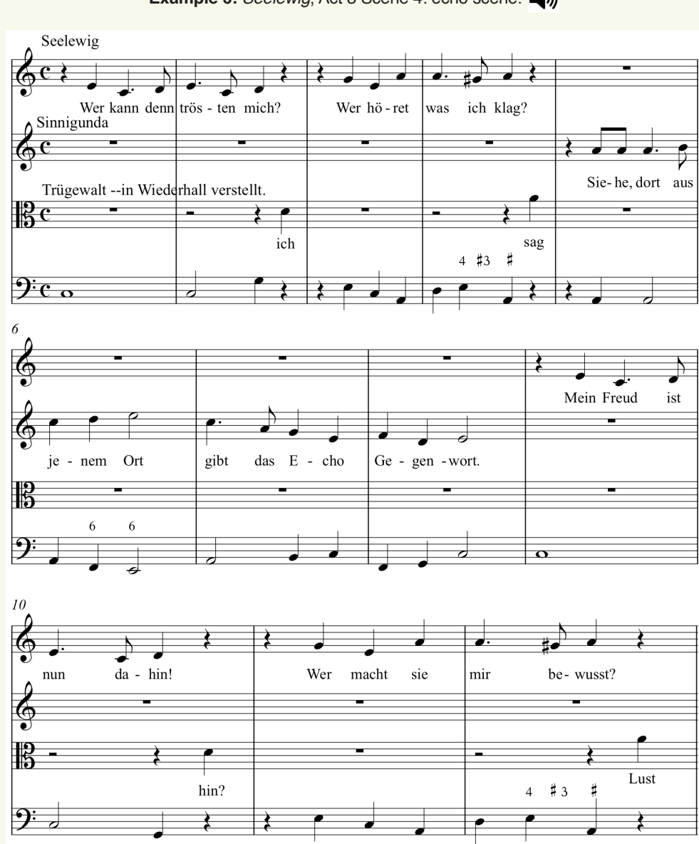
Example 6: Seelewig, Act 3 Scene 4: echo scene.

these techniques, in propagating a particular moral vision aligned with the Lutheranism practiced by the poets of the Nuremberg school. Staden in fact established a means by which German composers might plausibly negotiate a central problem facing German humanists in the seventeenth century, namely how to create a dramatic work on the foundation of a uniquely German ideology. Despite its generic dependence on foreign models, Seelewig resonates, in its sonic core as well as in its theoretical prescripts, with the linguistic, artistic, and theological ideals of its German humanistic authors.