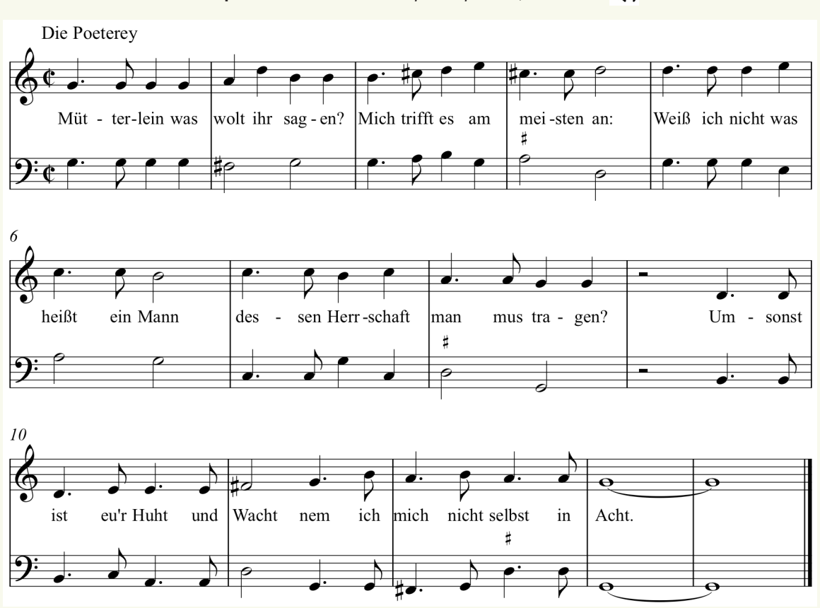
Example 1: Frauenzimmer Gesprächspiele IV, Liedlein 1.

Mother, what do you want to say? It concerns me the most: If I do not know what a man is, whose power must be borne? In vain is your guard and watch, if I do not take care myself.