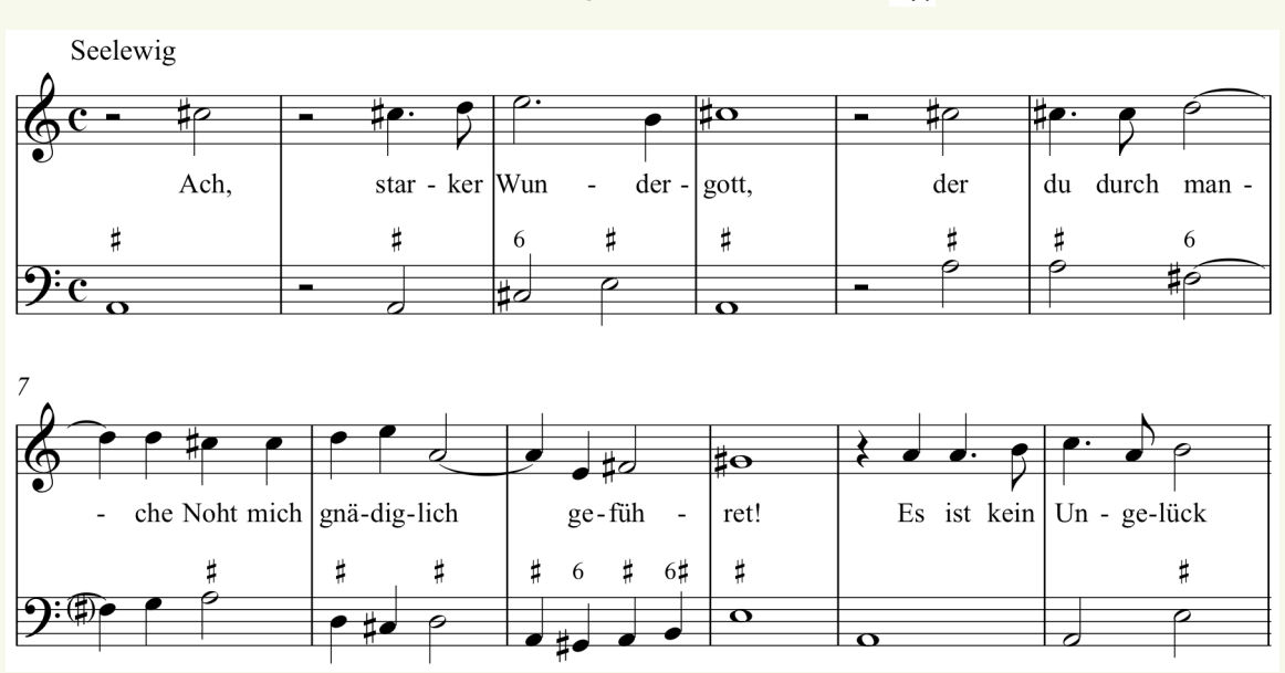
Example 7: Seelewig, Act 3 Scene 6, excerpt.