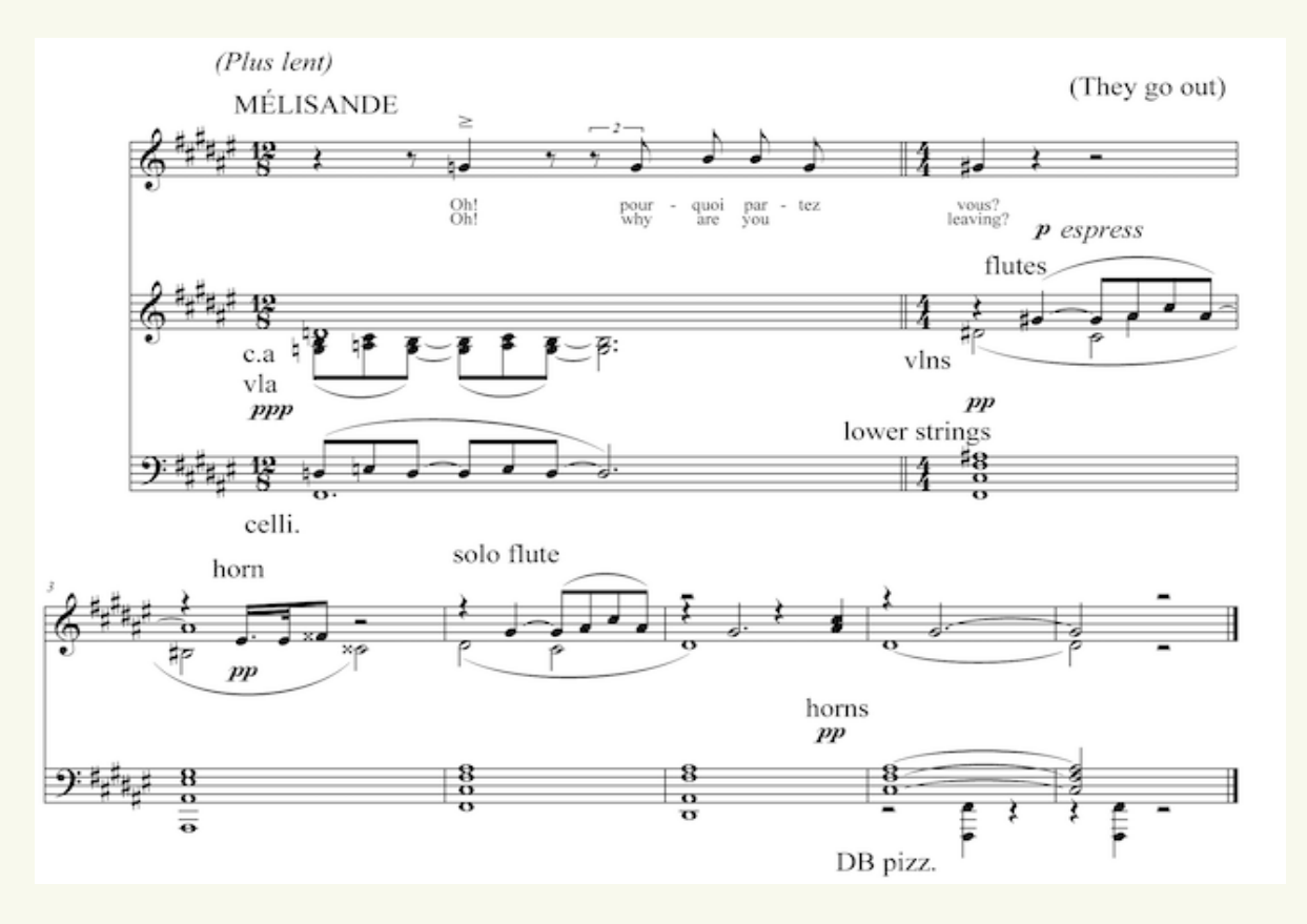
Example 2. (I. 47.5: VS 54)