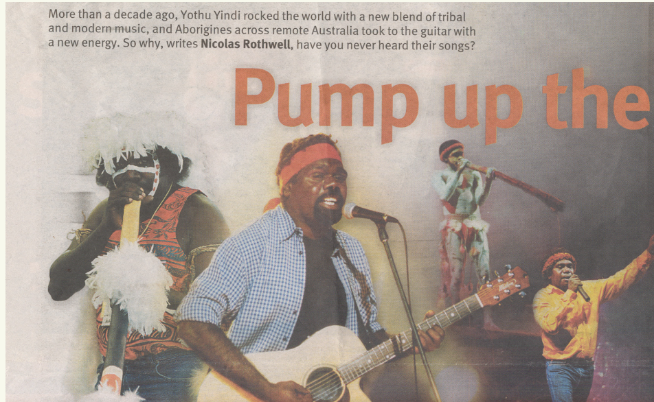
Figure 2: Article on Indigenous Australian Rock Music in The Australian ( Rothwell 2004a )

women performers play within, against and around Aboriginalist constructions of Indigenous performance, making their own kind of game in order to create a new discourse of what it means to be Indigenous Australian women performers.