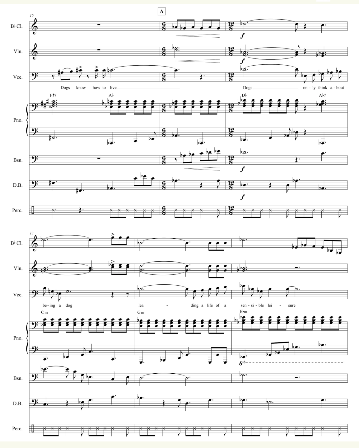
Example 8 & Sound Sample 8: No. 9, bars 10–15, Mr Barbecue, Elena Kats-Chernin.

lost traditional definition, Mr Barbecue complains that, whatever he does, he can't get it right. The rigidity of the motif, with its obtuse intervals stubbornly refusing to alter upon each repetition, is a direct allusion to the doggedness of the impossible man.