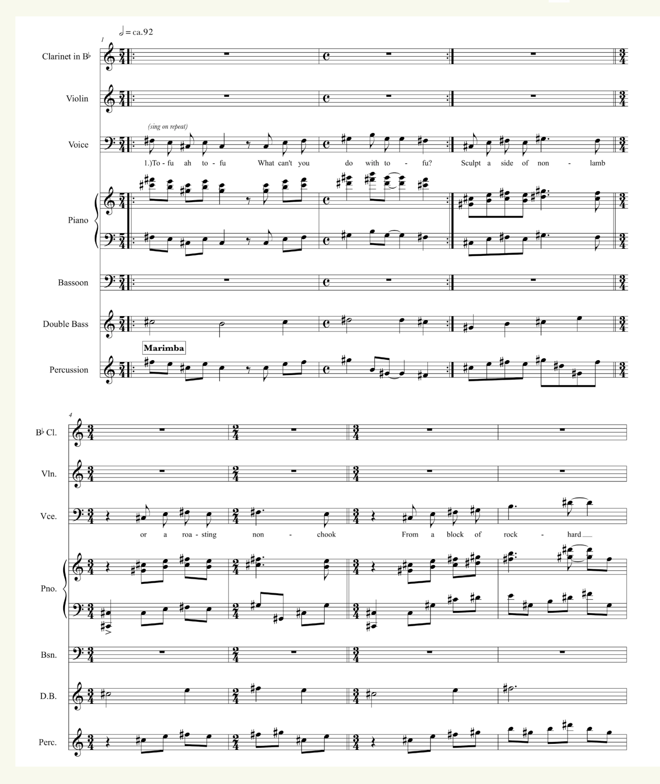
Example 5 & Sound Sample 5: No. 5, bars 1–7, Mr Barbecue, Elena Kats-Chernin.